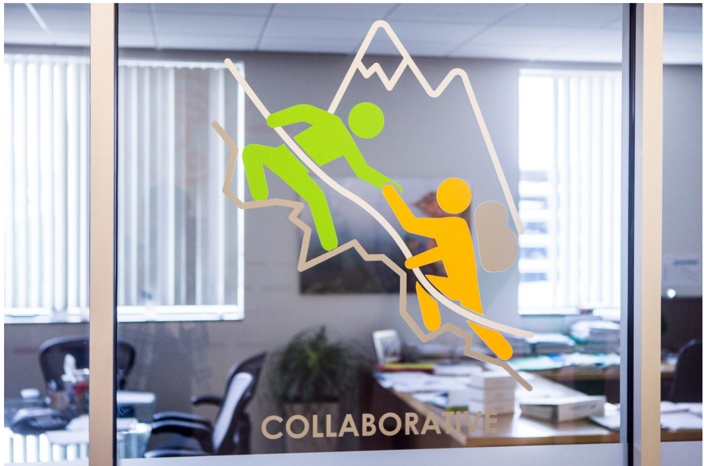
The Moderna offices in Cambridge, Mass.

"You want to be the guy who's going to fail them? I don't," he said in an interview from his glassy third-floor office. "So was it an intense place? It was. And do I feel sorry about it? No."